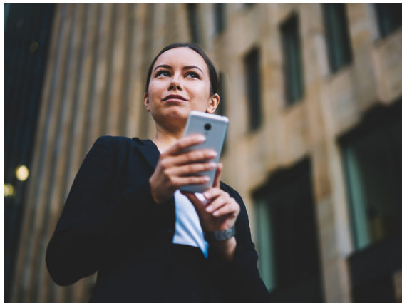
SL2 delivers a traceable and seamless Advisor-Client experience on one Mobile Business Number - in the office and on the go

All calls received on the landline telephone number are directed to the existing phone service provider and can be forwarded to the Advisor's Smartphone depending on whether the Advisor is in the office or on the go. When an Advisor makes a phone call from their SL2 mobile app - the caller ID is that of the landline. This feature helps to maximize the return on your existing landline infrastructure investment, drives Advisor productivity and protects Client continuity by providing them with one MBN which always remains with your organization for calling, texting or chatting.