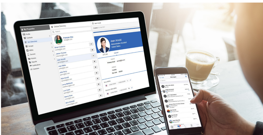
CellTrust SL2 - one desktop-to-mobile business number for text, voice and chat

The SL2 dashboard provides your compliance team with an easy to deploy and configure platform. They can set and change rules and policies, correlate and supervise voice, text and chat activities for enforcement, traceability and eDiscovery.